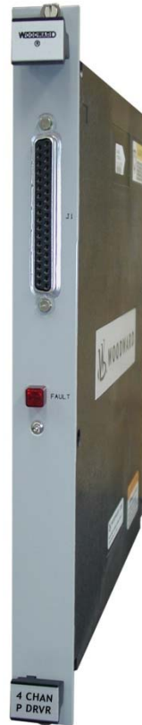
Figure 10-5—Four Channel Actuator Driver Module

This module requires no calibration; an actuator may be replaced with a like actuator without any module or software adjustment.